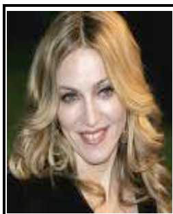
Madonna: Weird Poet. Very Rich.