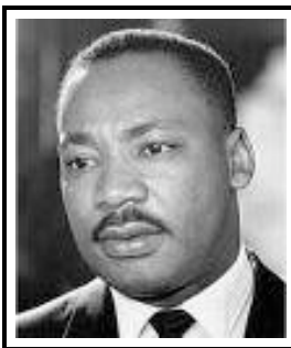
Martin L. King 1929-1968