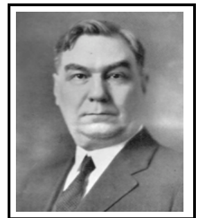
Charles Haanel 1861-1921