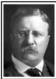
President Roosevelt 1858-1919