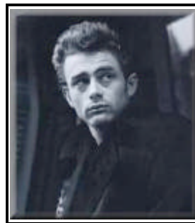
James Dean 1931-1955