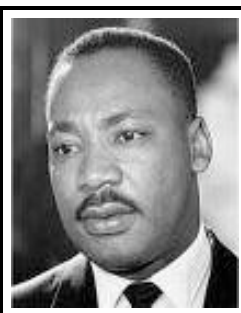
Martin L. King 1929-1968